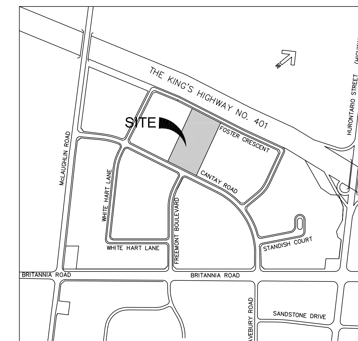
KEY PLAN N.T.S.